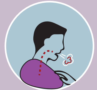
SHORTNESS OF BREATH, DIFFICULTY BREATHING

OTHER SYMPTOMS INCLUDE: CHILLS, REPEATED SHAKING WITH CHILLS, OR DIARRHEA