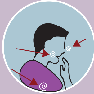
NAUSEA, VOMITING, OR CHANGES IN TASTE/SMELL