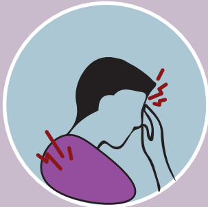
HEADACHE, MUSCLE PAIN